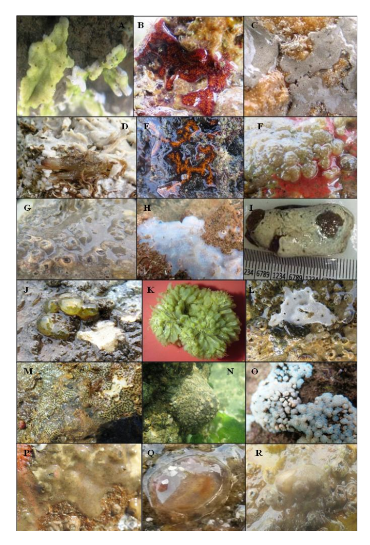
Figure 1 . Depicting the various Ascidian species collected during the survey along the Tamil Nadu Coast from the study periods 2016 & 2017

(A) Trididemnum miniatum (Kott, 1997), (B) Botrylloides nigrum (Herdman, 1886), (C) Didemnum psammathodes (Sluiter, 1895), (D) Herdmania momus (Savigny, 1816), (E) Botrylloides sp. (Herdman, 1886), (F) Eudistoma sluiteri (Hartmeyer, 1909), (G) Diplosoma variostigmatum (Hirose and Oka, 2008), (H) Aplidium multiplictatum (Sluiter, 1909), (I) Polyclinum isipingense(Sluiter, 1898), (J) Eudistoma tumidum (Kott, 1990), (K) Ecteinascidia venui (Meenakshi, 2000), (L) Lissoclinum fragile (Van Name, 1902), (M) Symplegma oceania (Tokioka, 1961), (N) Polyclinum indicum (Sebastian, 1954), (O) Aplidium sp. (Sluiter, 1909), (P) Synoicum sp. (Phipps, 1774), (Q) Corella eumyota (Traustedt, 1882), (R) Styela canopus (Savigny, 1816)